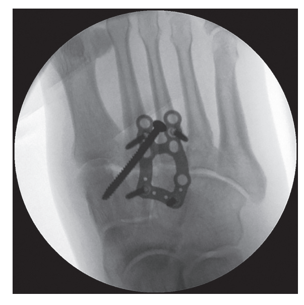
Figure 4: Intraoperative image intensifier view of open reduction and internal fixation with dorsal plate. A separate screw fixation has been performed to achieve Lisfranc joint reduction.

medial and central columns, while lateral column stability was not improved with screw fixation versus K-wire fixation [37]. Absorbable fixation devices and suture button systems have also been described in the literature, with promising early results [36,40]. External fixators find their application in open fractures and for initial management of soft tissue swelling.